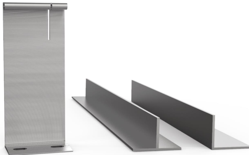
NVELOPE® Rainscreen Systems