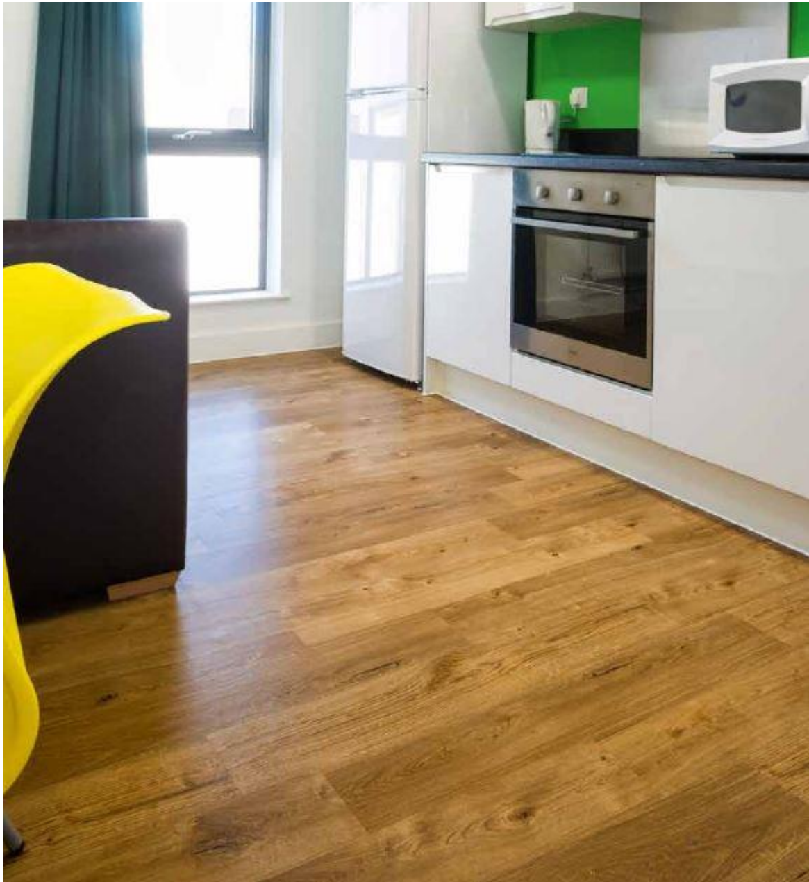
Fig1 Image of product