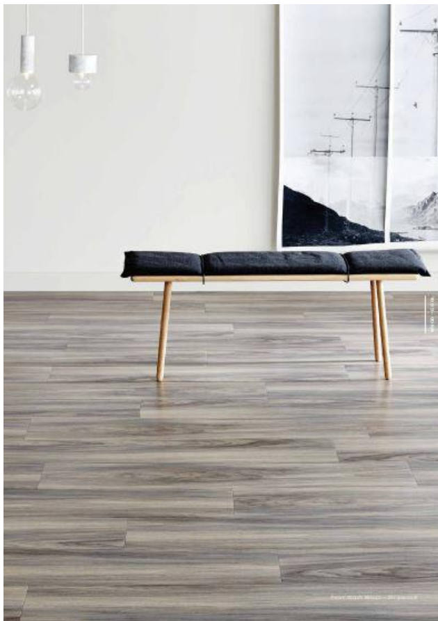
Fig1 Image of product