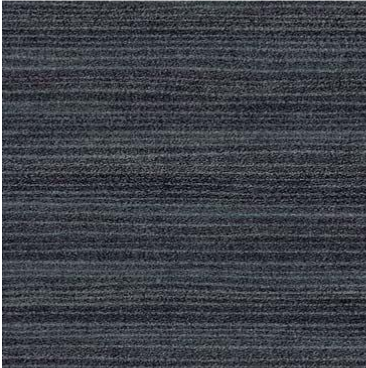
Fig1 Image of product