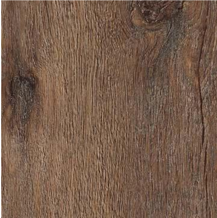
Fig1 Image of product