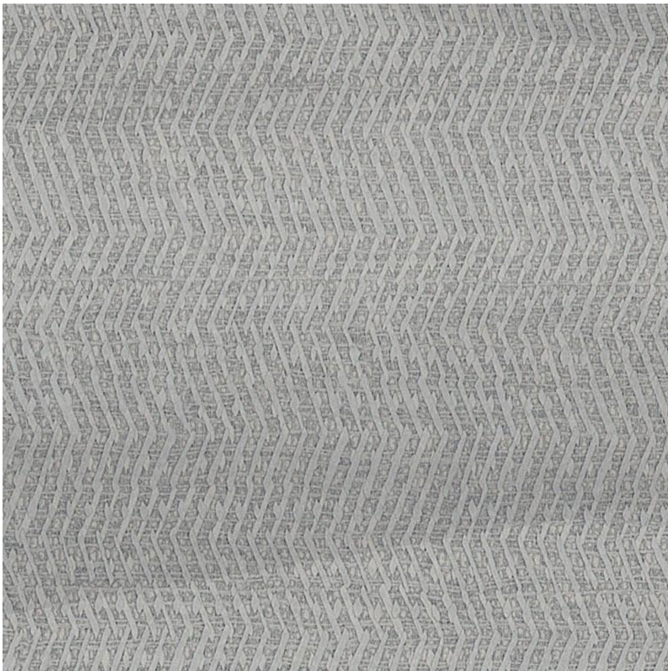
Fig1 Image of product