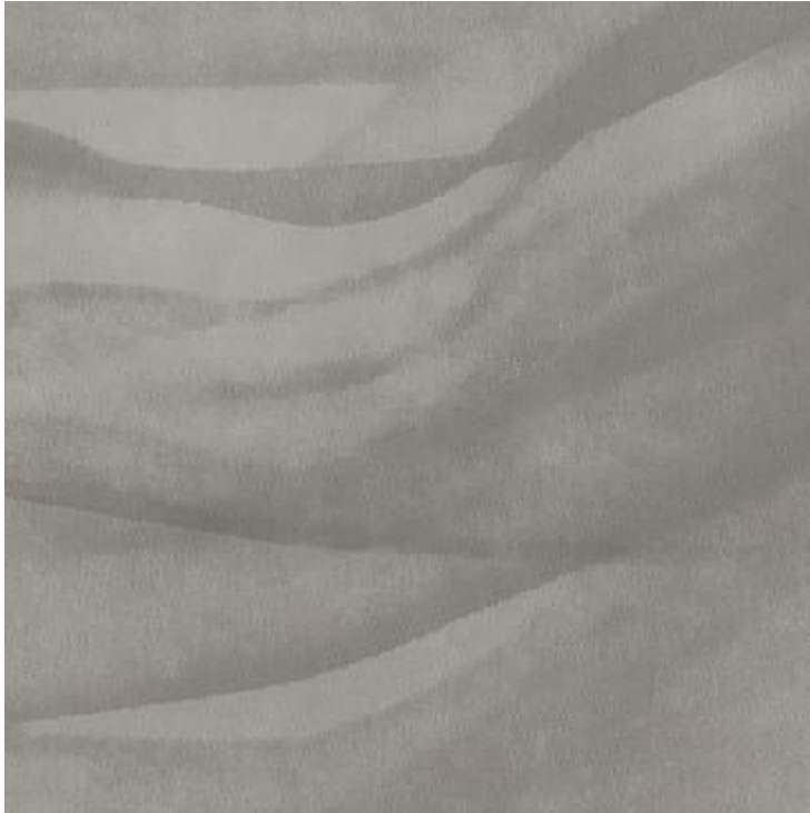
Fig1 Image of product