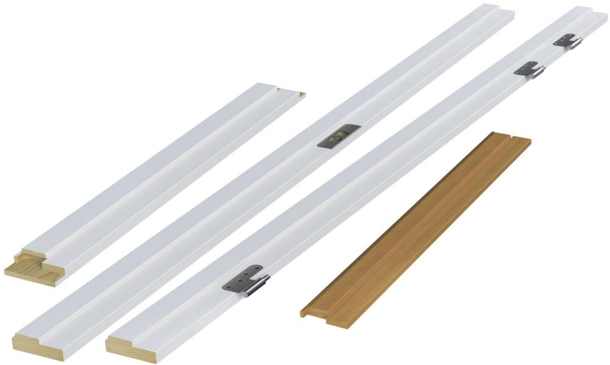
Figure 1 Painted frameset for a door leaf.

JELD-WEN holds FSC multi-site certificate since 2011. Majority of JELD-WEN products on the European market are available as FSC and PEFC certified.