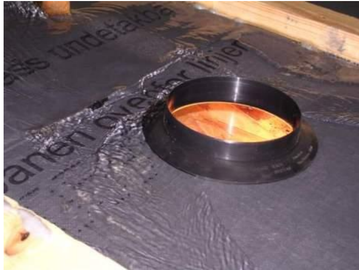
Figure: A4.1 An underlay sealing ring in test and subject to a very large volume of water.

An example of an underlay sealing ring in test for water-tightness