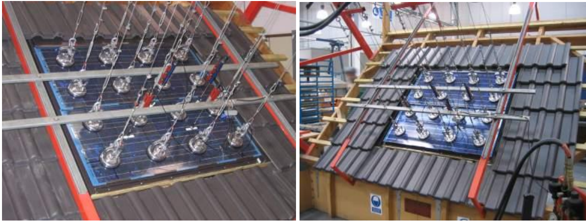
Figure A1.2 Typical PV System undergoing a wind uplift test according to the principles of BS EN 14437 : 2004

Test arrangement for carrying out tests to BS EN 14437 : 2004