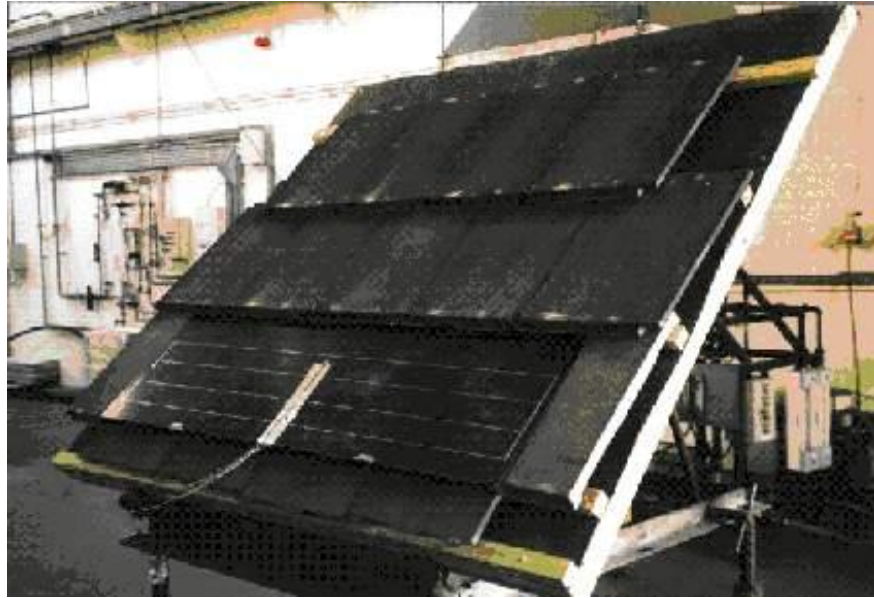
Figure: A2.1 A typical PV system ready for testing to BS 476-3 2004.