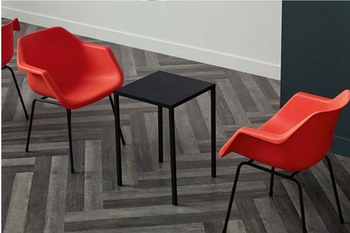
Fig1 Image of product