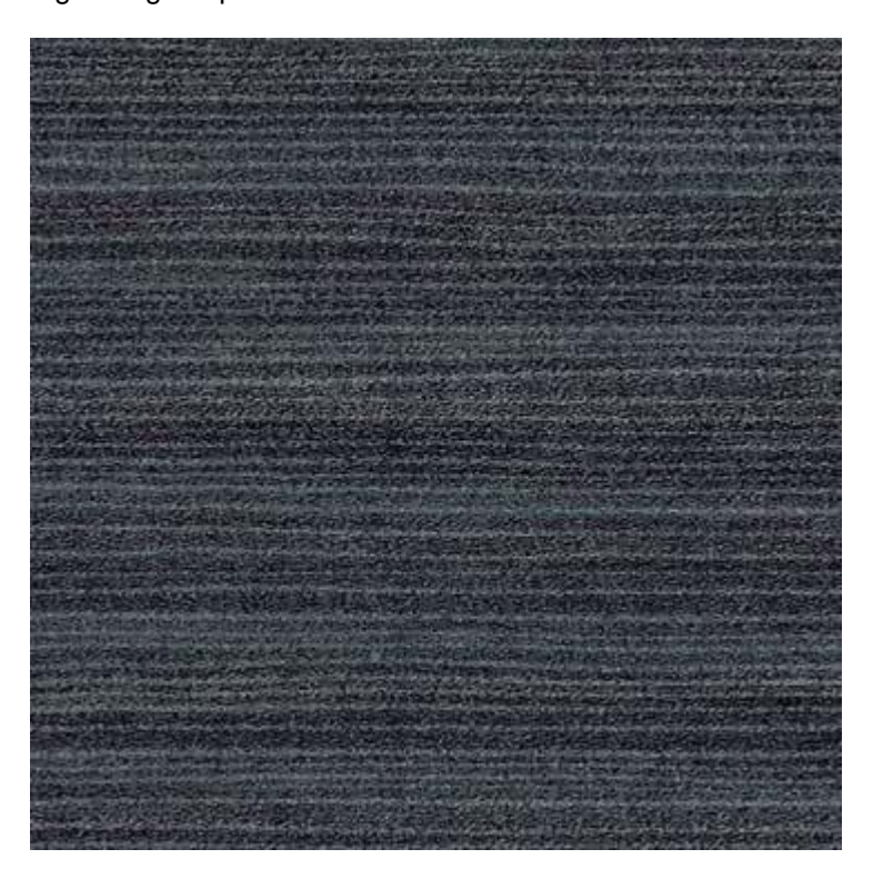
Fig1 Image of product